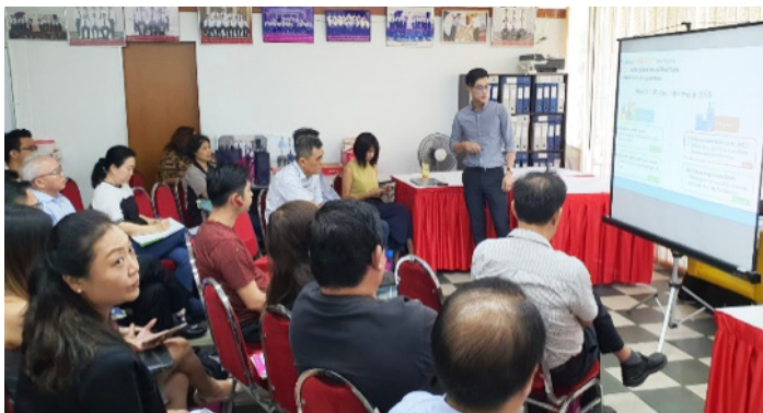
J-Clinic Session organised at AMK Autopoint Tenants Association in Mar 2020.